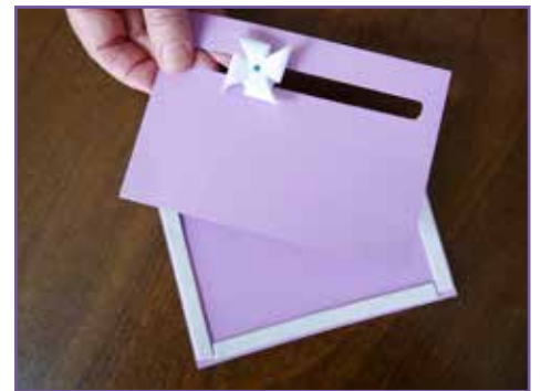
9. Stick the Spinner card on top of it