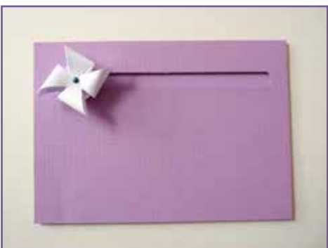
10. The result.