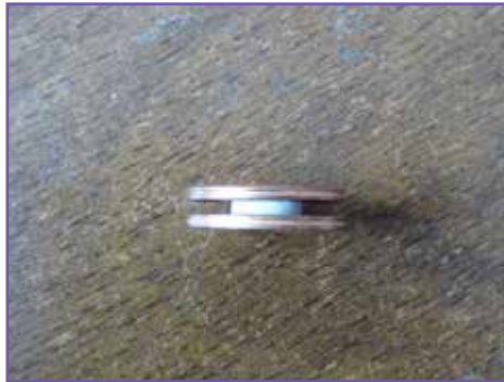
5. Put the other coin on top of it.