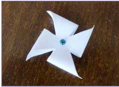
2. Put a spacer through the hole and fold the mill.