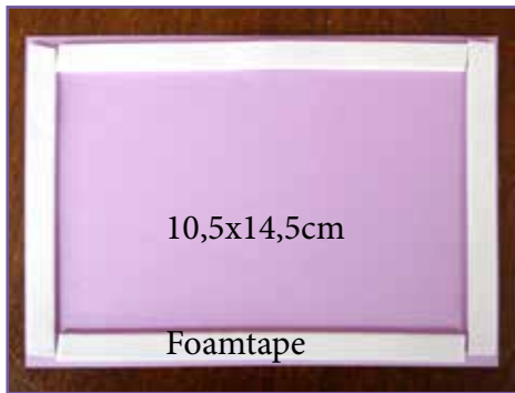
8. Put foam tape on the back card.