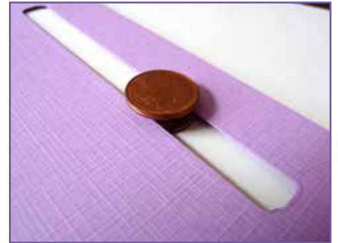
6. put this between the slit.