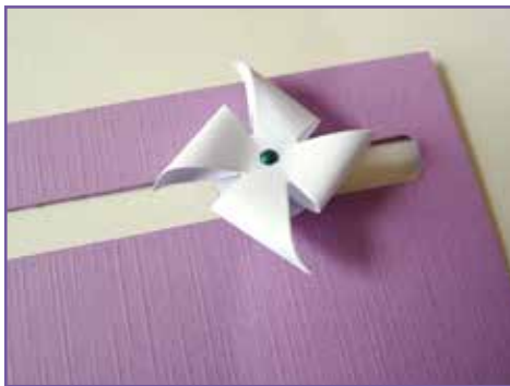
7. Stick the mill on top of the coins.