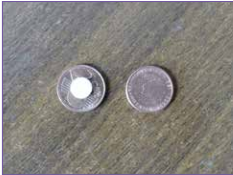
4. Put circle foamtape on a 2 cent coin.