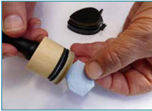
2. Ink the front and back edges.