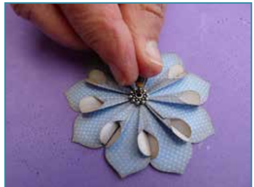
9. Put a brad and a spacer in the middle.