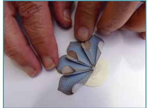
6. Put the shapes on the circle.