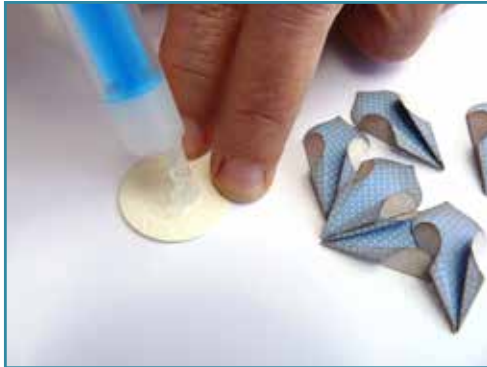
5. Put some 3D kit on the circle.