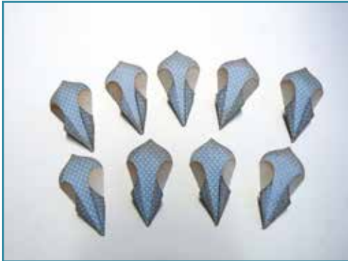
4. Fold all shapes.