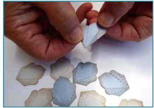
3. Fold on the perforated lines.