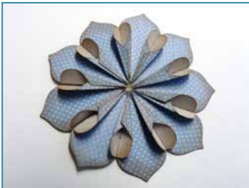
7. Slide the shapes until you are satisfied.