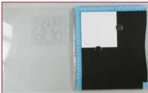
5. Close the lid so that the stamp will stick.