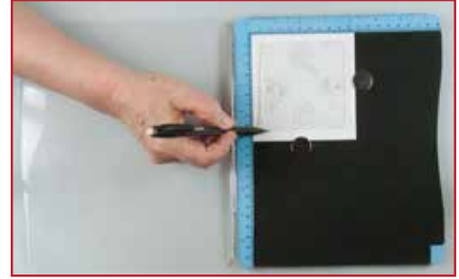
3. Place the stamp upside down on your card. Draw a pencil line around the position angle.