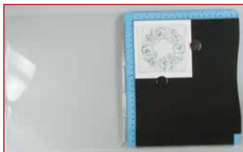
11. Repeat this with your third stamp and this is the result!