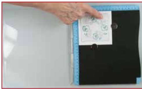
8. Place your second stamp on the pencil lines.