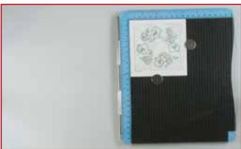
10. Close the lid and stamp.