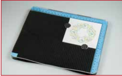
1. Materials: Stamping Buddy Pro, cardstock, Layered stamps, Memento ink.