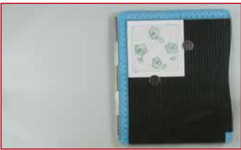
7. Close the lid and stamp.