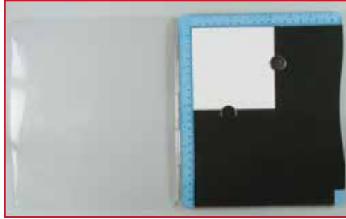
2. Place your cardstock on the Stamping Buddy Pro. Secure your card with the magnets