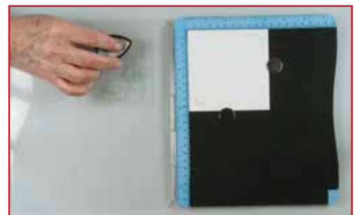
6. Ink the stamp.