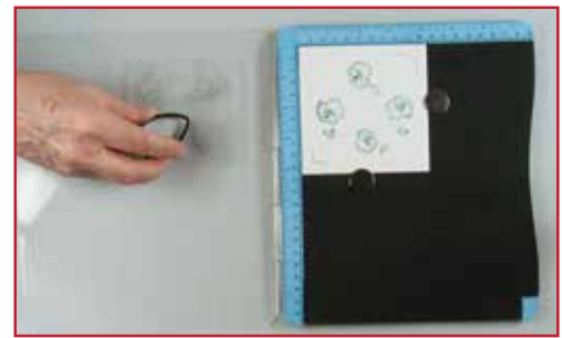
9. Ink the stamp with your next colour.