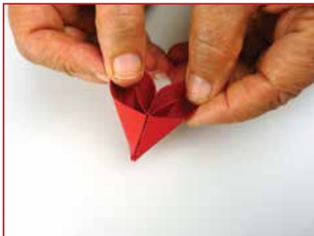
Glue two parts together.