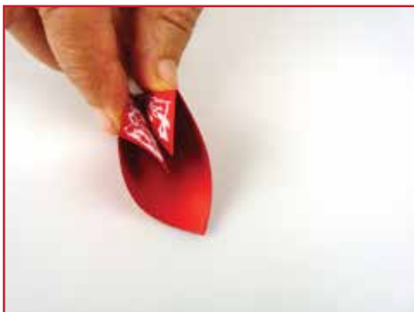
Glue the parts together.