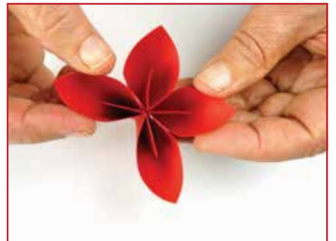
Glue the other shapes together to make the flower