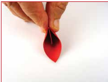
Let it dry.