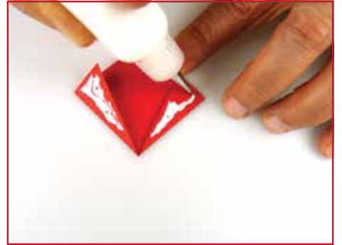
Put Tacky Glue on the folded parts.