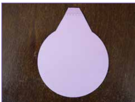
7. Die cut the lens.