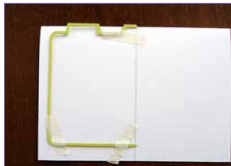
3. Attach the Die on the folded cardstock and cut it out.