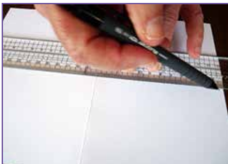
2. Put a guide line at 8,5 cm.