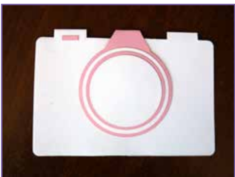
10. Decorate your card as you wish.