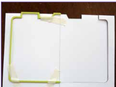
5. Turn the cardstock and die cut the other side.