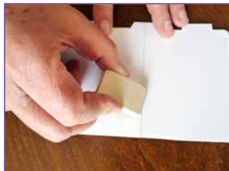
6. Erase the pencil line.