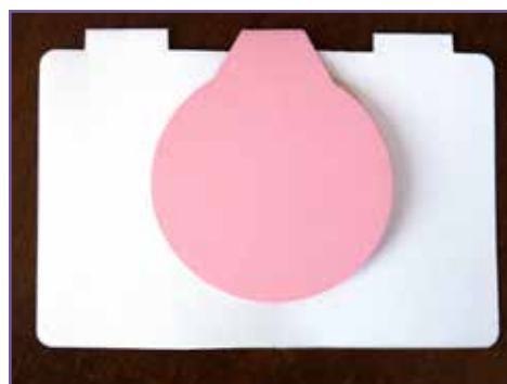
9. The result.