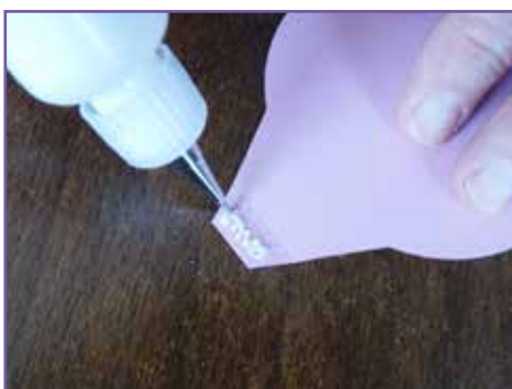
8. Attach the lens on the backside of the card.