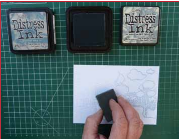
3. Ink the card with the lighter color using a sponge