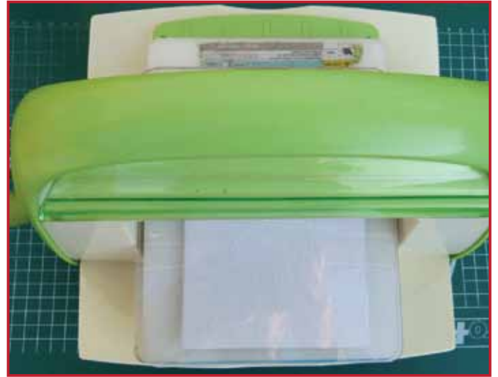
2. Emboss the white card using a Picture Embossing Folder