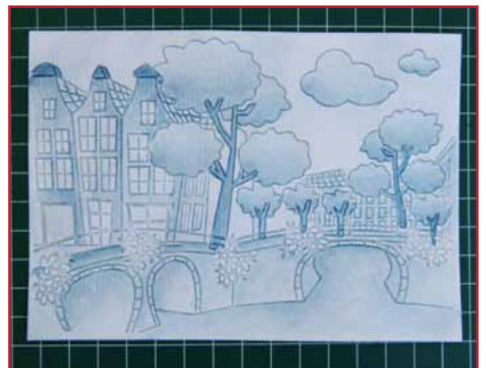
6. The result