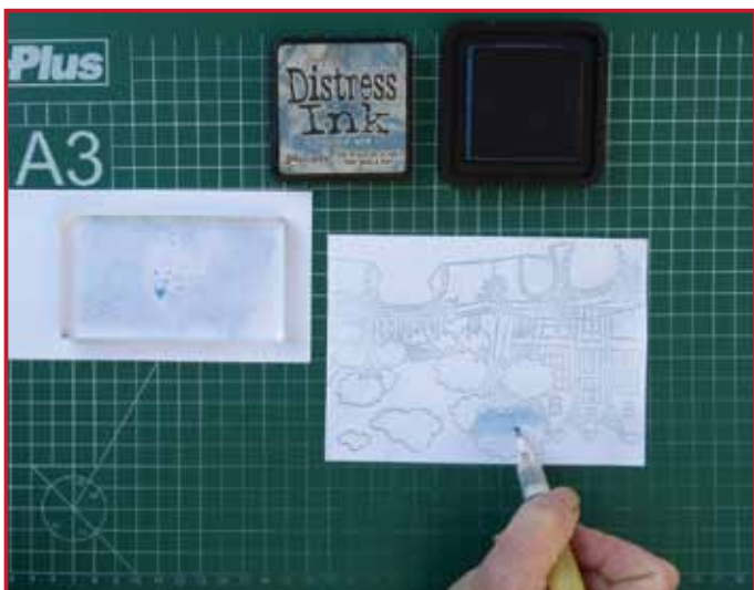
5. Take a little bit of the darker color with a water brush and fill the shapes with a rotating movement