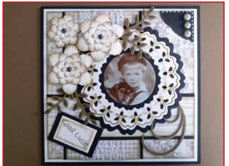
6. Make a nice card.