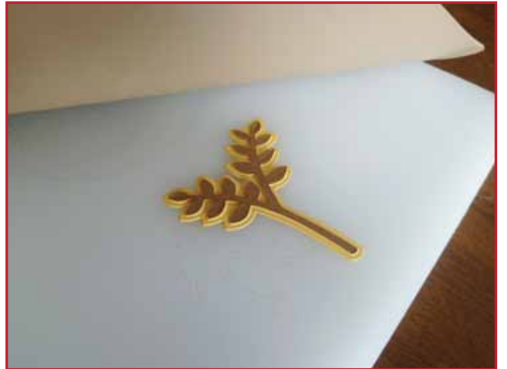
4. You can process the shape's again through the die-cutting machine with the embossing mat.