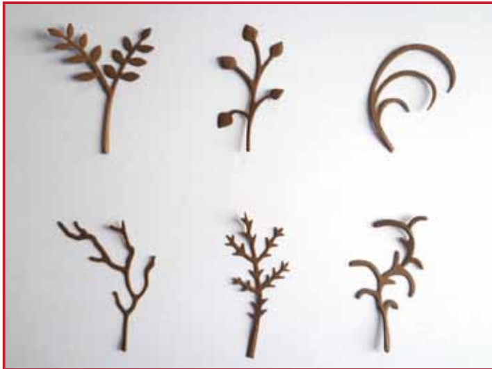
3. These twigs can be used on your card.