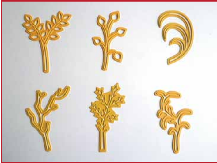
1. There are 6 different twigs Shape Dies available.