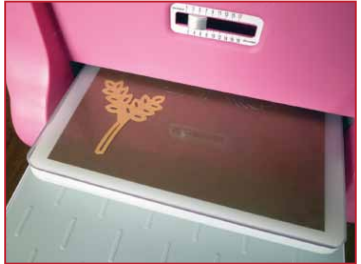
2. Cut the Shape out using a machine.