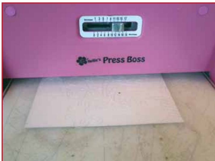
1. Embos a piece of watercolor paper.