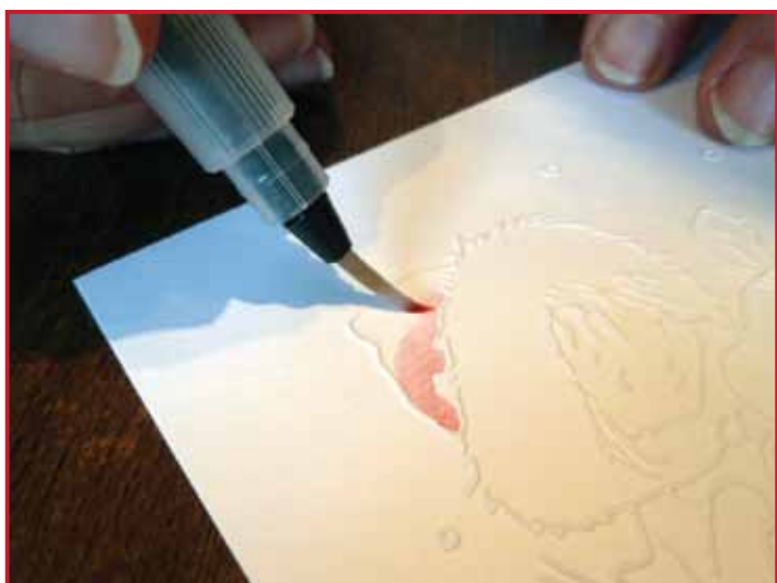
4. Color the embossed print/picture as desired. Do this with circular motion and start where the colour must be the darkest.