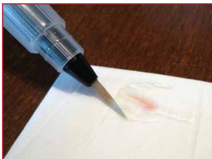
5. Wipe after each colour your brush on a tissue.