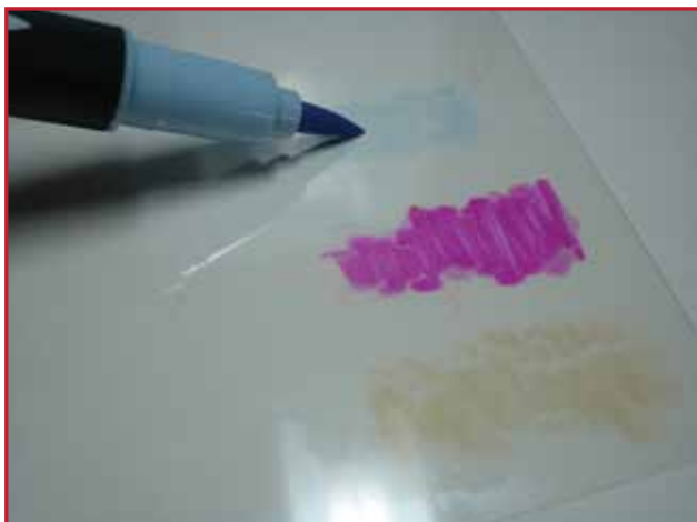
3. Wipe some ink on a transparent sheet.