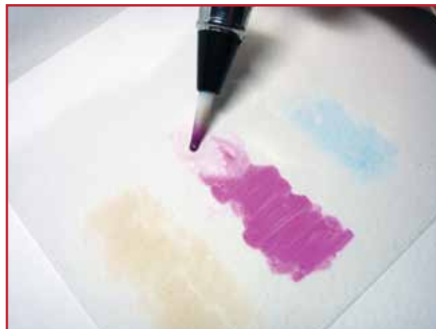
4. Take ink on with the water brush.