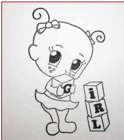
1. Stamp a print on watercolor paper with pigment ink.