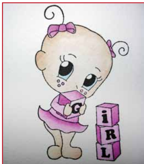
6. The result!