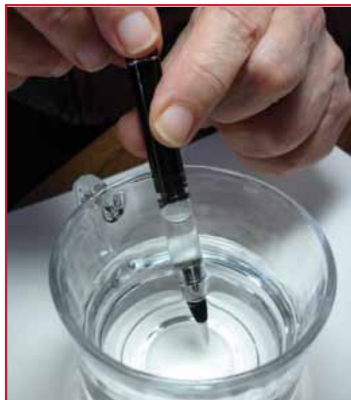
2. Fill the brush with water. (to do this, turn to the upper part)