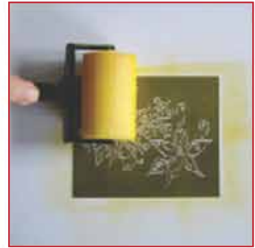
3. Ink the mold, this is the background color