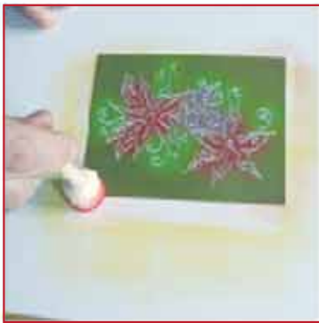
7. Ink the edges and corners