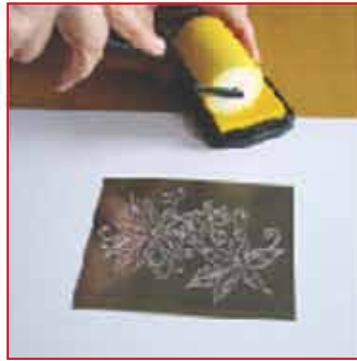
2. Ink the sponge roller.