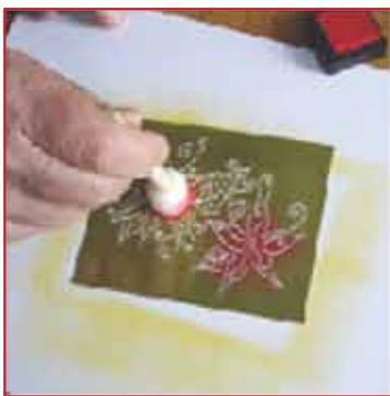
4. Color the flowers red with a Foambrush