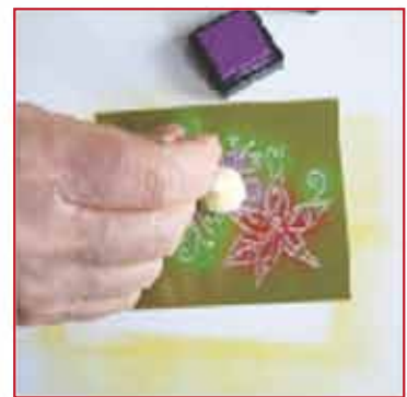
6. You can give the little flowers a different color.