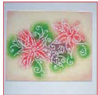
12. The result!