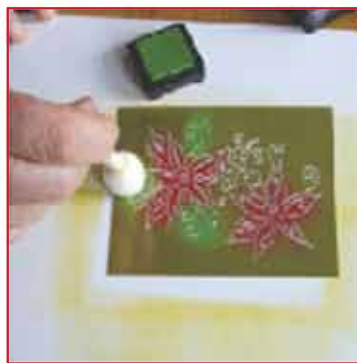
5. Color the leaves green.