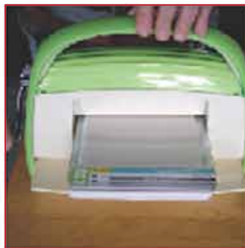
12. Put the upper plate on top and process through the machine