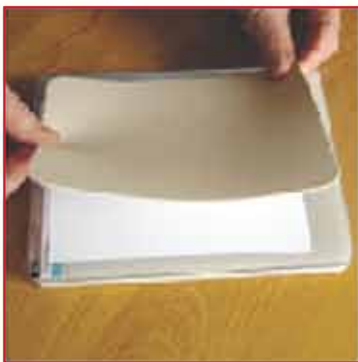
10. Put the embossing mat on top