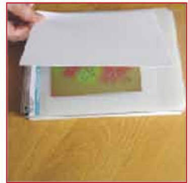
9. Put the cardstock on top, the right side facing downwards