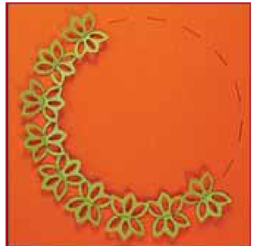
6. Fold the two figures open to create a flower.