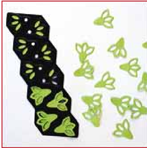
4. The result