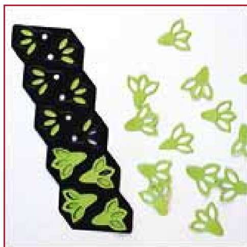
4. The result