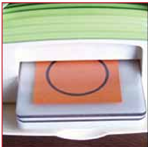
1. Use a Die-cutting machine to cut out the Die