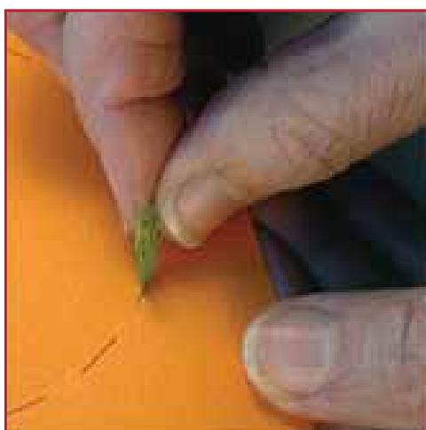
5. Stick two figures through the slit