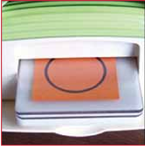
1. Use a Die-cutting machine to cut out the Die