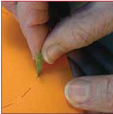
5. Stick two figures through the slit