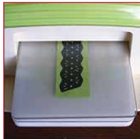
3. Die-cut the little shapes