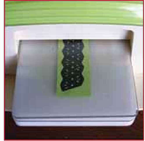
3. Die-cut the little shapes