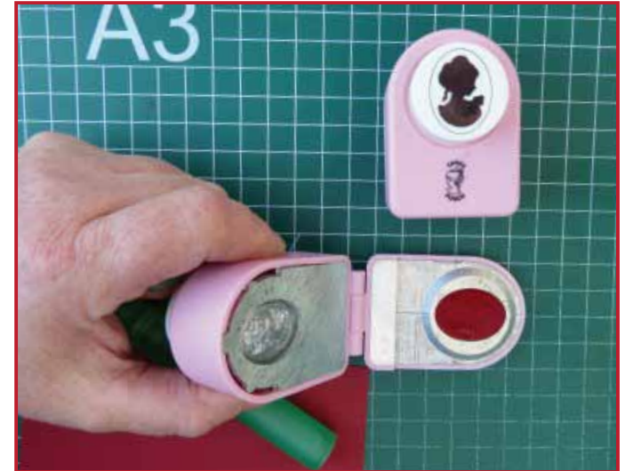
4. Put the oval with the wet side on top in the embossing punch