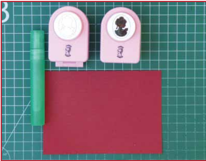
1. Materials : Cameo punch, cardstock, mini mister with water