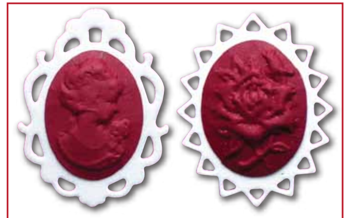
6. The result