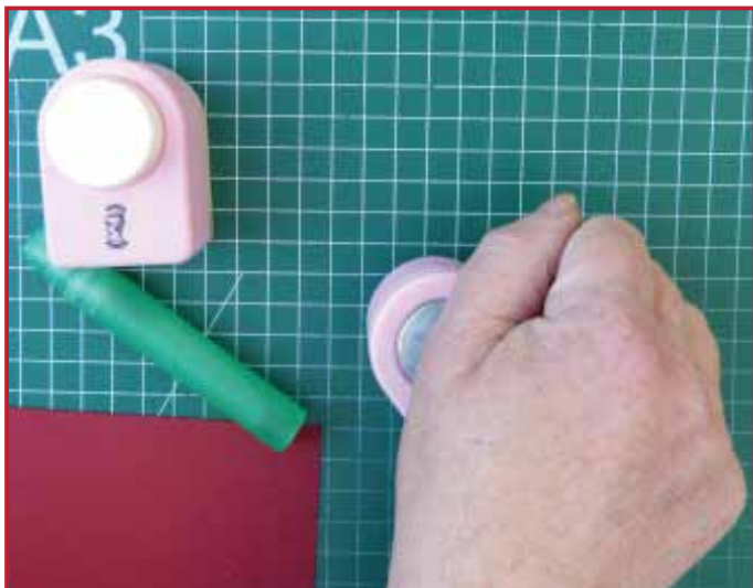
5. Push firmly with a rotating pressure and the button facing downwards