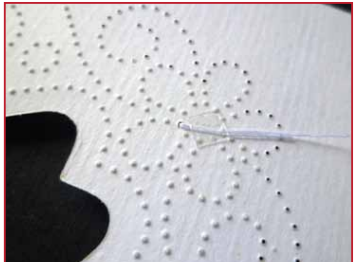
4. Don't start with a knot, but paste the yarn with an embroidery sticker