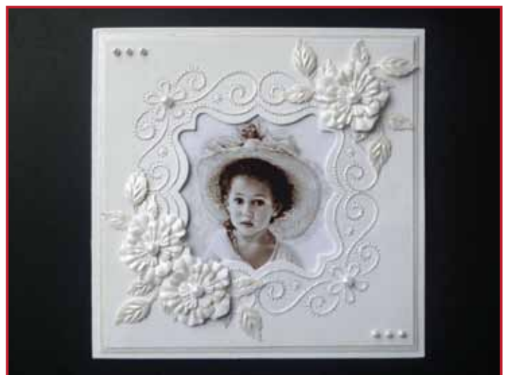
6. The result