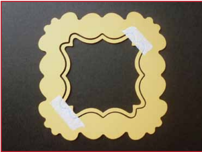
1. Tape the Dies you want to cut together with easy to tear away tape