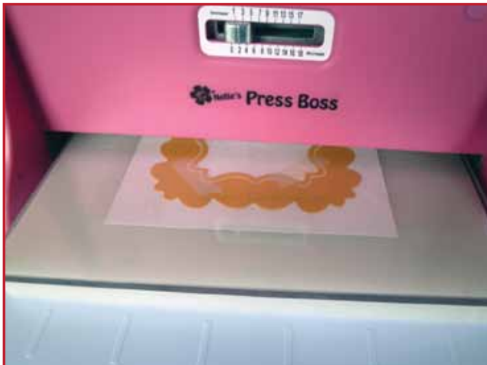
3. Process this through the Die-cutting machine