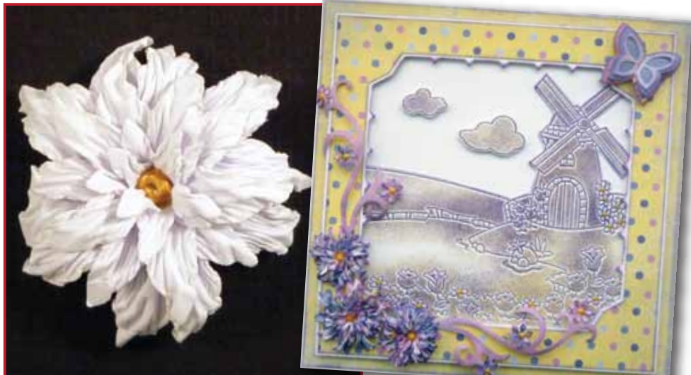
6. Stick the flowers on top of each other, and this is the result!