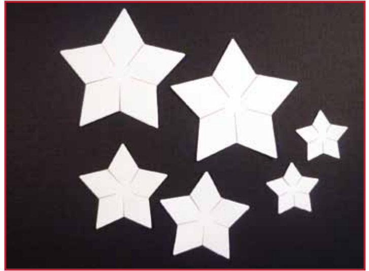
2. Cut each shape shown in the picture