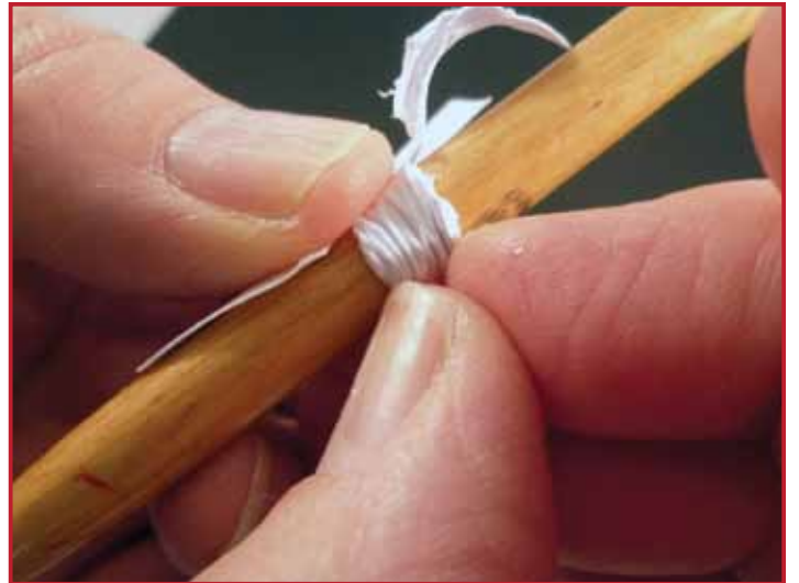
4. Squeeze the leaves into shape and pull them to a round object.