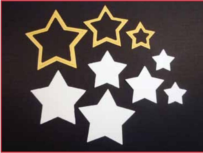
1. Cut out 2 stars from the three biggest shapes using a Die-cutting machine