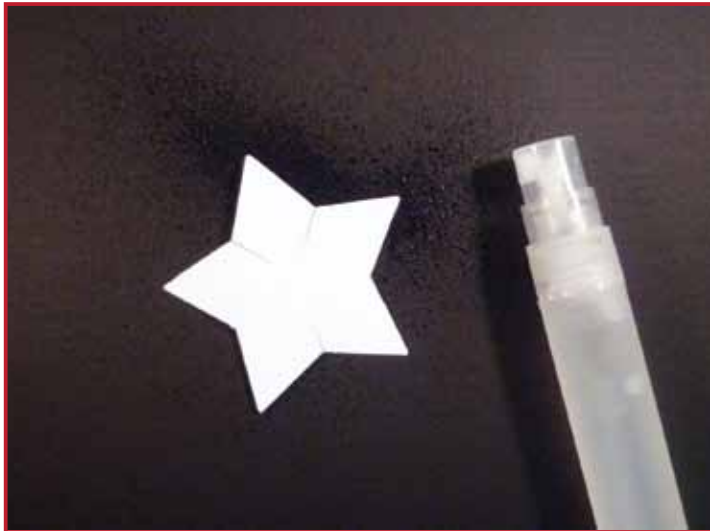
3. Wet the shape with a mini mister or a sponge